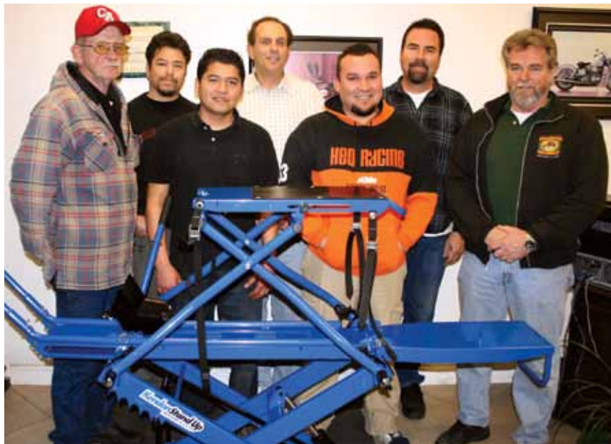
Kendon Stand-Up MotoLift serial number #00001 and the men behind the product.